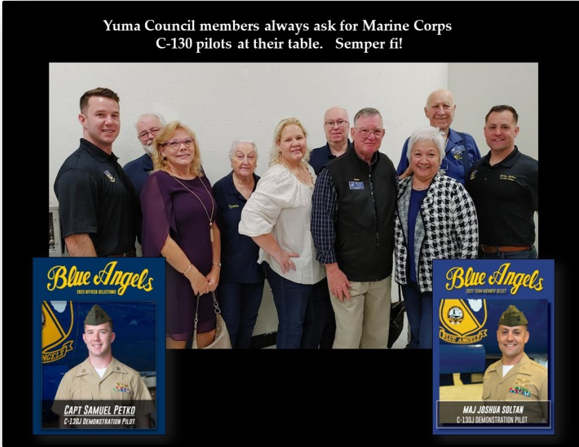
Yuma Council members always ask for Marine Corps C-130 pilots at their table. Semper fit!