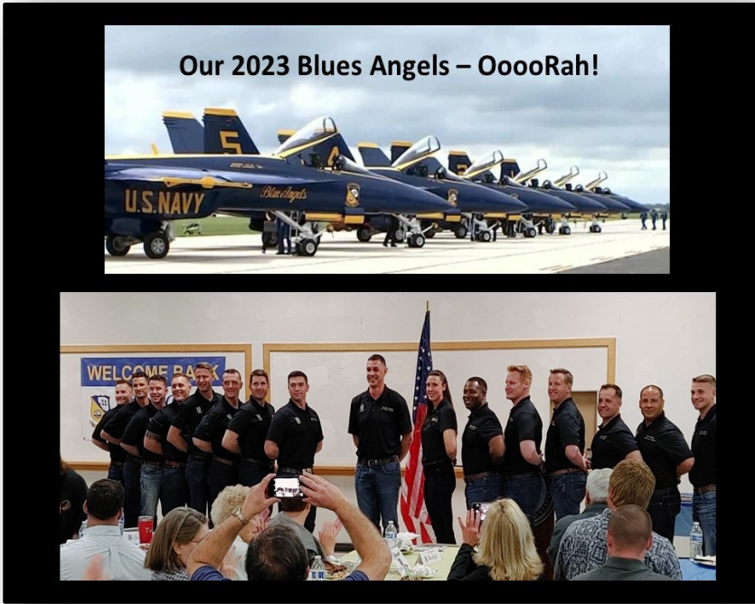
Our 2023 Blues Angels – OoooRah!

Career-oriented Navy and Marine Corps jet pilots with an aircraft carrier qualification and a minimum of 1,250 tactical jet flight-hours are eligible for positions flying jets Number 2 through 7. The Marine Corps pilots flying the C-130J Hercules aircraft, affectionately known as "Fat Albert," must be aircraft commander qualified with at least 1,200 flight hours. BZ, Blue Angels!