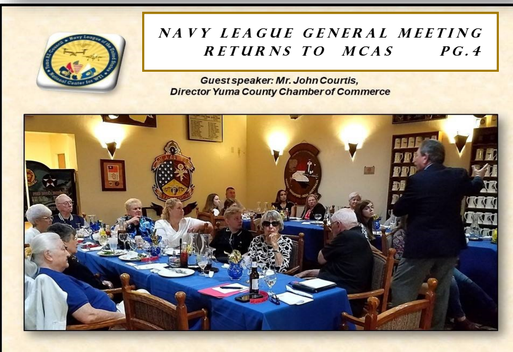
NAVY LEAGUE GENERAL MEETING RETURNS TO MCAS PG.4