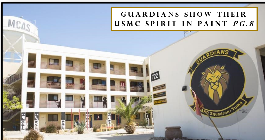
GUARDIANS SHOW THEIR USMC SPIRIT IN PAINT PG.8