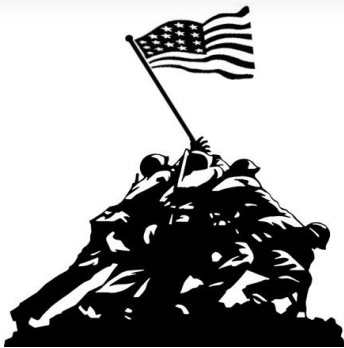
Sailor & Marine Memorial Project

The 2019 NL 'Crusin Yuma' car show had a record turn out. 110 cars, great music, and good eats. Sponsored by our Fortuna de Oro RV Resort, the event went a long way in supporting our JROTC college scholarship awards. See everyone next year!