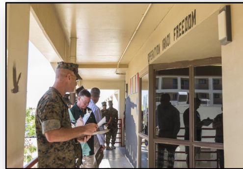
Sr. officer and invited VIPs check their scores