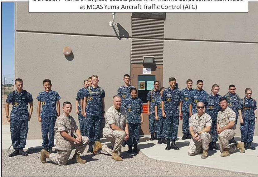
OCT 2017: Yuma's navy sea cadets pose with Marine Corps senior staff NCOs at MCAS Yuma Aircraft Traffic Control (ATC)

We can be justifiably proud of our Yuma Navy League Cadets and Naval Sea Cadets. Training this Fall included instruction in Land Navigation, basic Seamanship, and in-depth experience at MCAS Yuma's Air Traffic Control (ATC) facility; a FAA air controller training site.