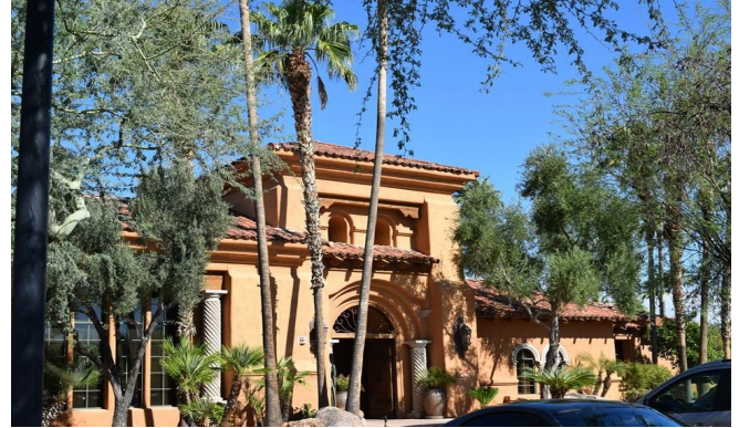
Sea Cadet Find Raiser Pebble Creek Golf Resort, Glendale AZ