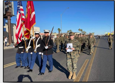
Veterans Day MCJROTC color guard