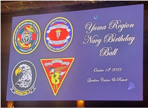
The 2023 NAVY BALL was well attended