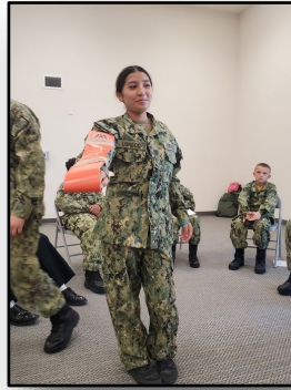
Sea Eagles' First aid training