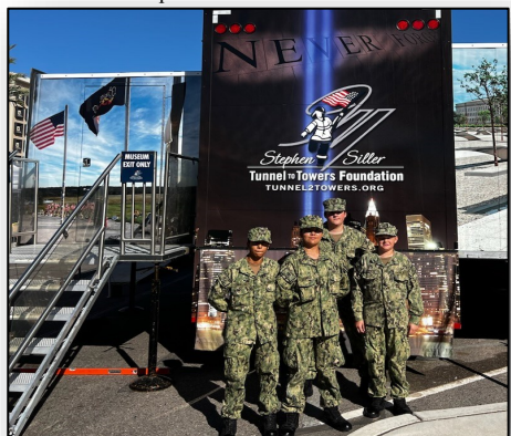
Yuma Sea Eagle Squadron cadets looking sharp

Our council established the display truck's escort with local and veteran motorcycle groups, managed the crowd flow, dispensed water when needed, and ensured the lines moved smoothly. Active duty MCAS Marine volunteers assisted the rig's operator in setting up and tearing down the display in typical Marine professional fashion. Semper Fi.