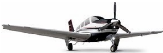
AZ ACTIVE AIR FAA JROTC Pilot Program