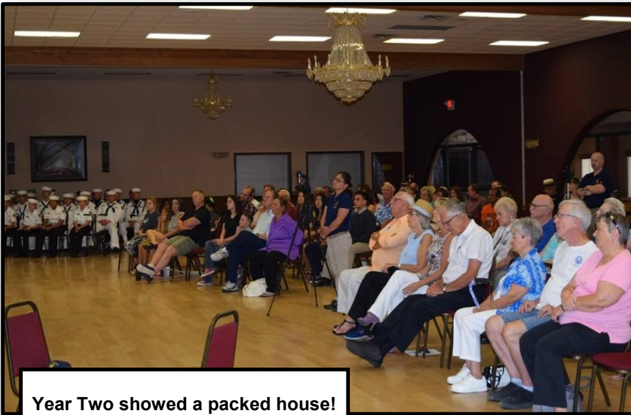
Year Two showed a packed house!