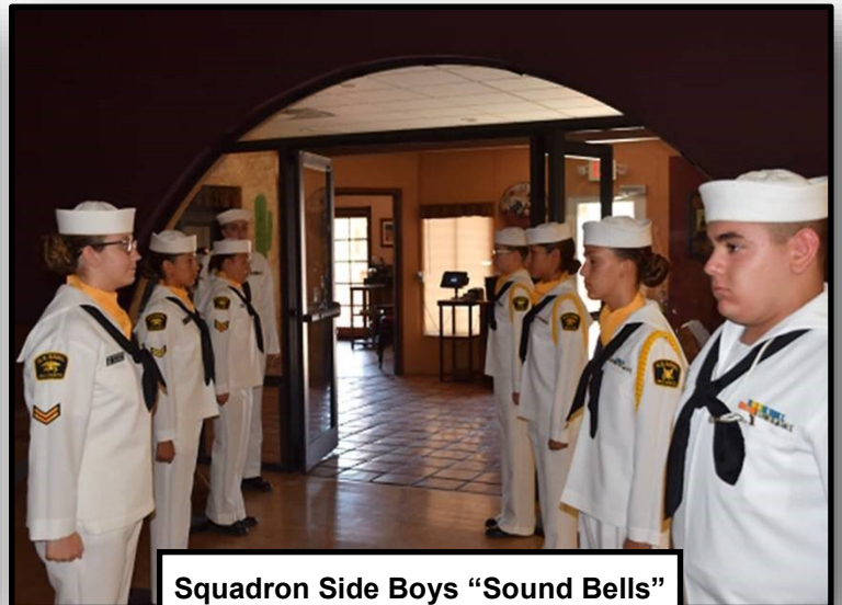
Squadron Side Boys "Sound Bells" for Distinguished Visitors