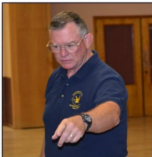
Hey, aren't those guys w/sea cadets Navy League members ?