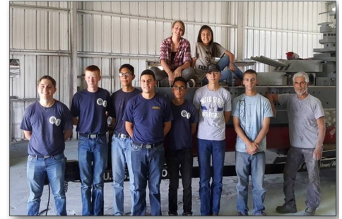
El Centro CA Desert Eagle and Yuma AZ Sea Eagle Squadrons, NSCC

A team effort! Thanks Yuma Sea Eagle Squadron (NSCC) for hosting brother youth leadership units; The Yuma MC JROTC, El Centro CA Desert Eagle Squadron (NSCC), and Tucson Bn (NSCC).