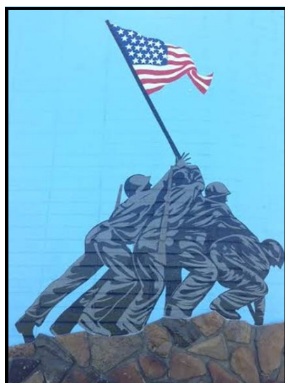
MCAS Main Gate Memorial Upgrade