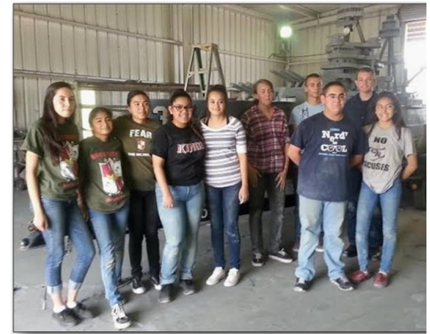
Yuma MC JROTC cadets and Yuma AZ Sea Eagle Squadron, NSCC