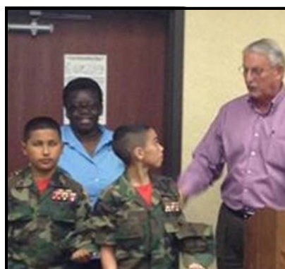
Yuma Young Marines $500.00