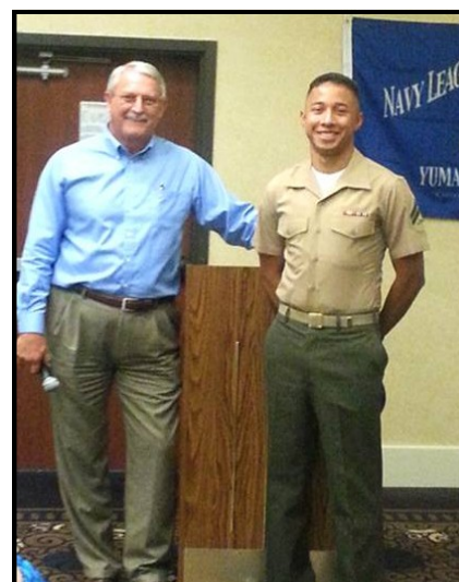
MCAS Single Marine Program $500.00