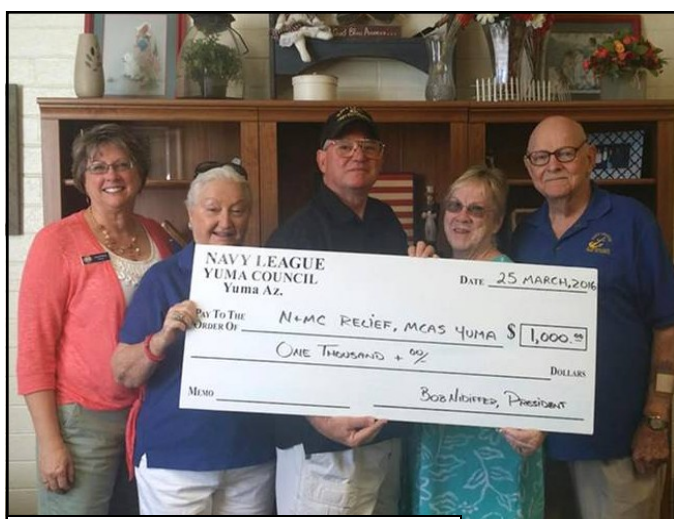
MCAS YUMA N&MC Relief $1,000