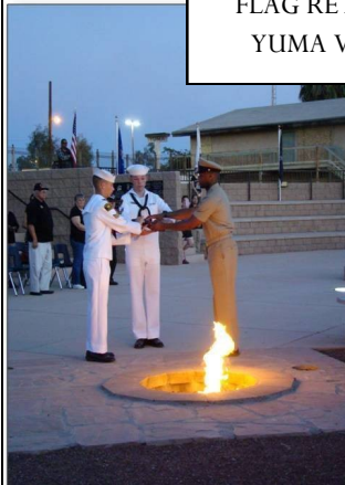
FLAG RETIREMENT CEREMONY, YUMA VETS MEMORIAL PARK