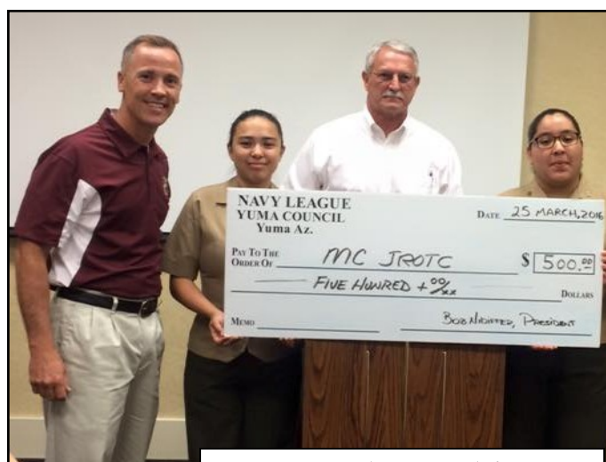
MC JROTC (KOFA HS) $500.00