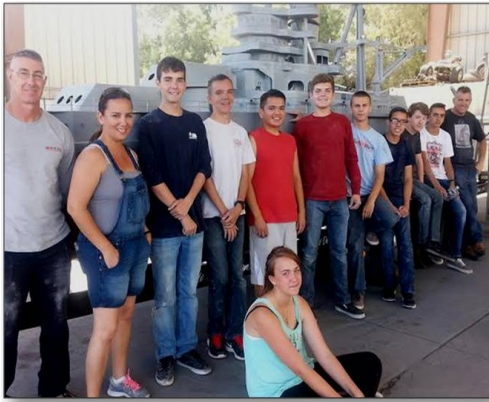
Tucson Seabee Battalion and Yuma AZ Sea Eagle Squadron, NSCC

As the Yuma community has rallied around the cosmetic restoration of the USS AZ replica this past month, our Sea Eagle Squadron hosted several local youth programs to make this effort a truly regional one! Over several weekends, our cadets hosted volunteers from our own MCJROTC plus naval sea cadets from Tucson AZ and El Centro CA. After all the dust cleared and donuts eaten, the superstructure was sanded and ready for paint.