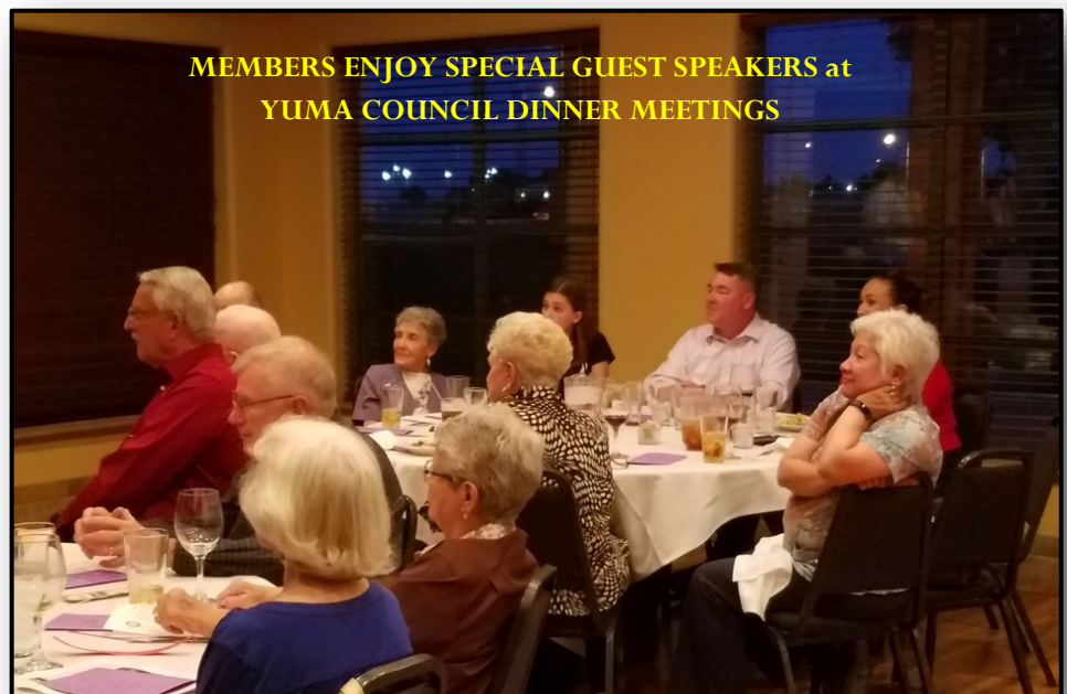
MEMBERS ENJOY SPECIAL GUEST SPEAKERS at YUMA COUNCIL DINNER MEETINGS