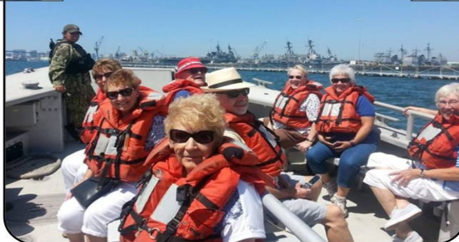
August 2015 Yuma Council's San Diego US Navy Harbor Run