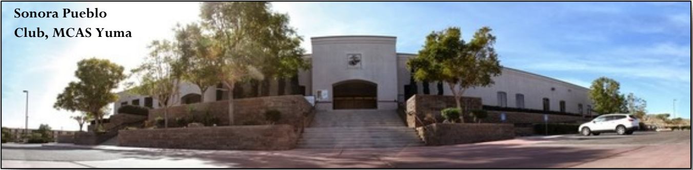
Sonora Pueblo Club, MCAS Yuma